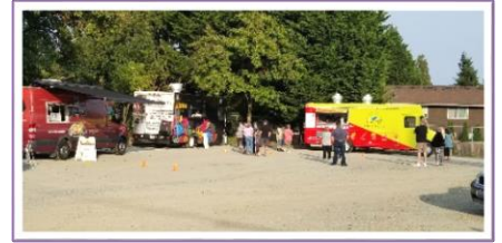
October 2020 - Food Truck Lot, Madison and Beverly