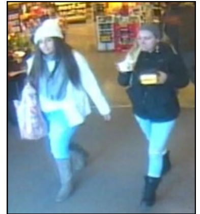
(Same female suspects)