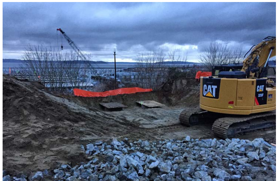
Pacific Rim Plaza Splash Fountain and Grand Avenue Park Bridge

The Everett waterfront is improving right before our eyes. It is becoming a resource that will better serve the city's residents, draw visitors from abroad and provide cultural, dining and recreational facilities to benefit us all. The Northwest Everett Neighborhood is fortunate to be so close to all that is happening, even if we must endure a little banging from time-to-time.